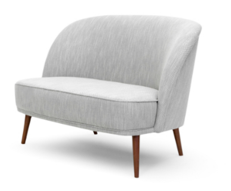
LITTLE | 2-SEATER

A reinterpretation and adaptation of our armchair Little, the shape is captivating, the corners generous and, more than visually pleasing, it is quite comfortable